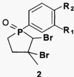
Fig. 1: 1-Aryl-2,3-dibromo-3-methylphospholane 1-oxides 2 (substituents of 2a : R_1=R_2=H ; 2b : R_1=NO_2 , R_2=H ; 2c : R_1=CN , R_2=H ; 2d : R_1=Br , R_2=H , 2e : R_1=H , R_2=Br ).

anti-tumor agents will be developed. In this paper, we will deal with the preparation of derivatives of 1-aryl-2-phospholenes 1 and 1-aryl-2,3-dibromophospholanes 2 , and the evaluation of their anti-cancer activity by MTT in vitro methods against leukemia cells.